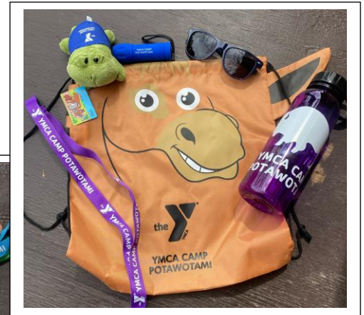
Camp Essentials Package